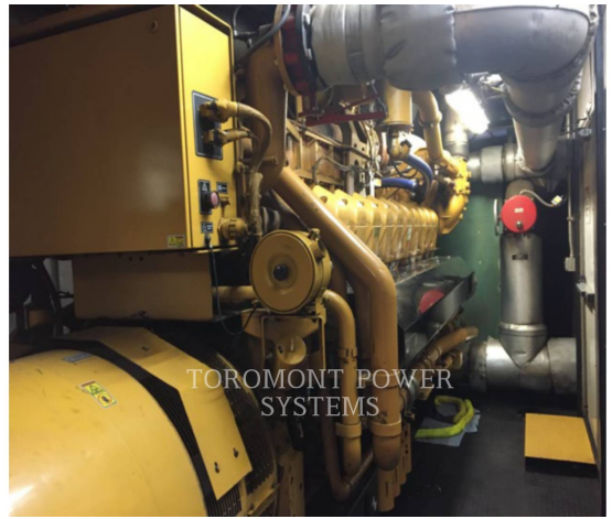
TOROMONT POWER SYSTEMS